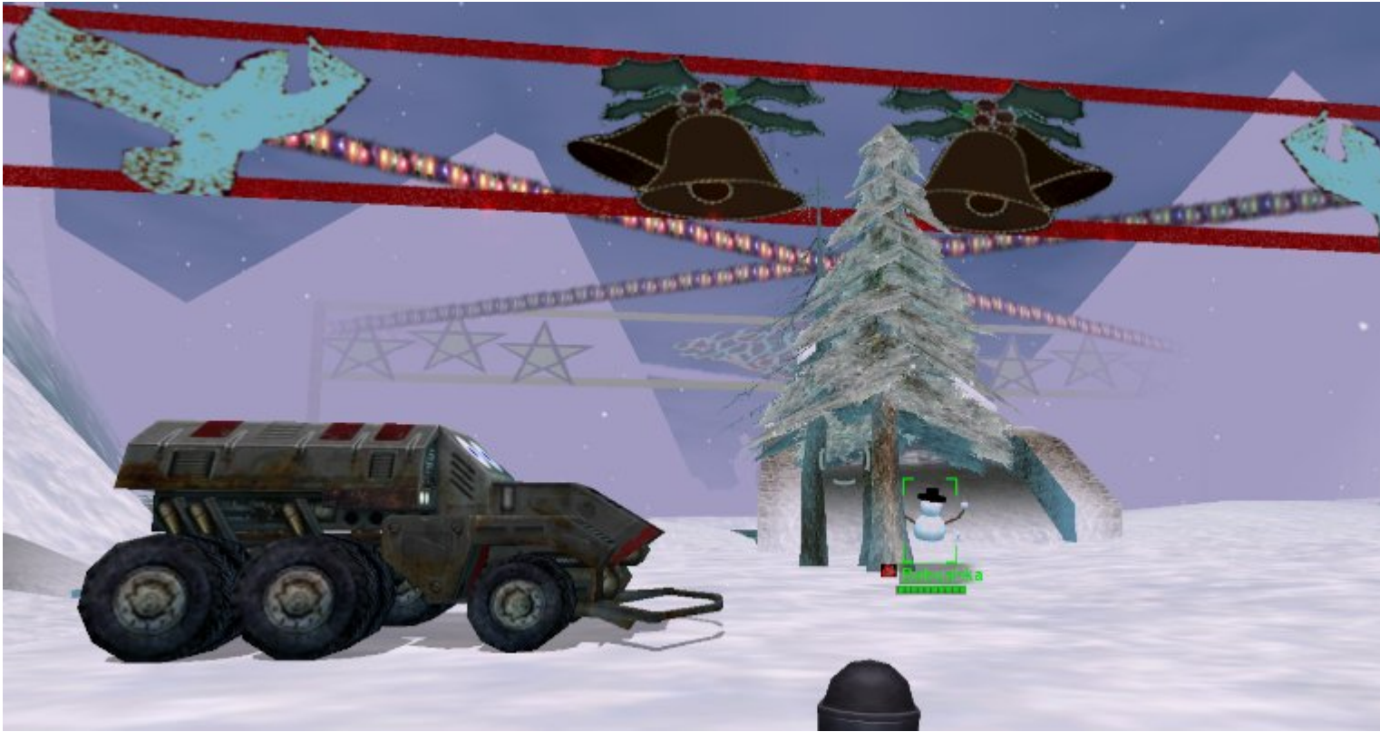
2) 2.jpeg , downloaded 510 times