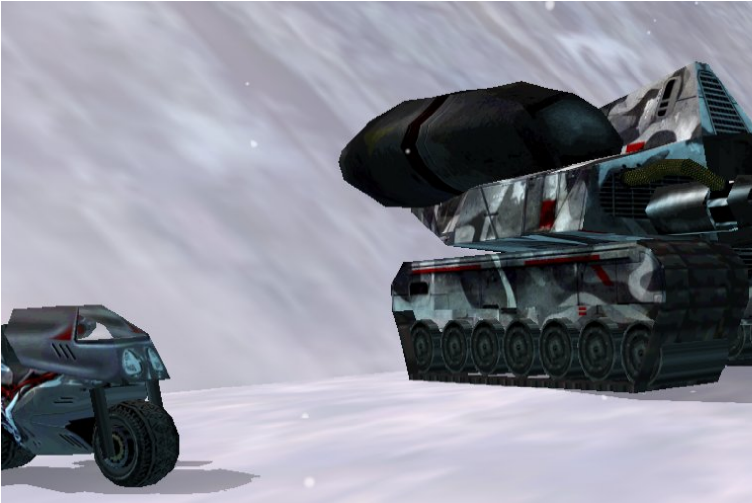
4) 4.jpeg , downloaded 796 times