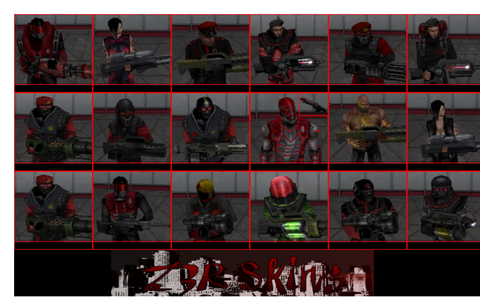
3) other.png, downloaded 533 times