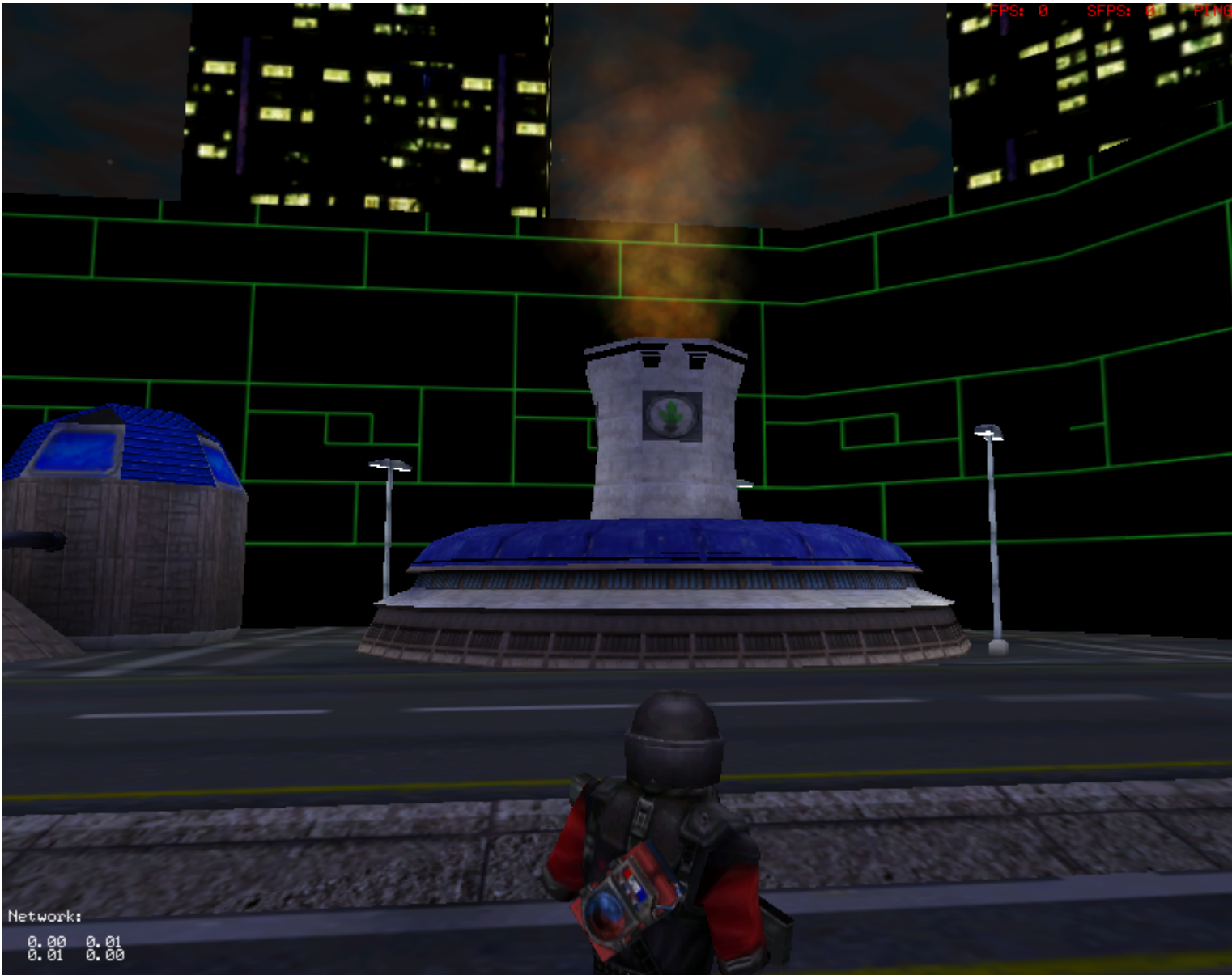
5) ScreenShot07.png , downloaded 918 times