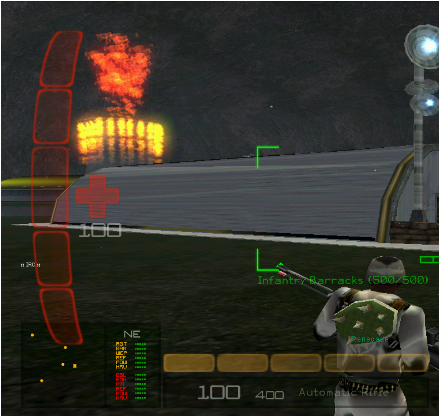
7) Game 2009-08-02 15-59-56-17.png , downloaded 354 times