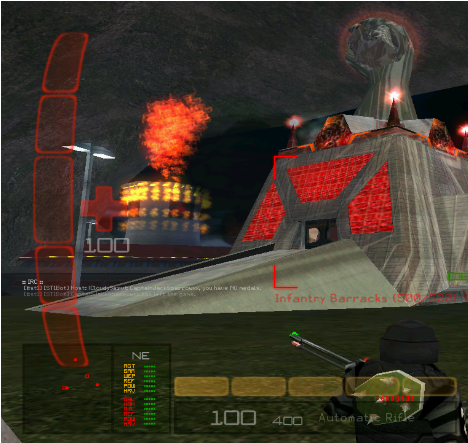
9) Game 2009-08-02 16-01-12-10.png , downloaded 274 times