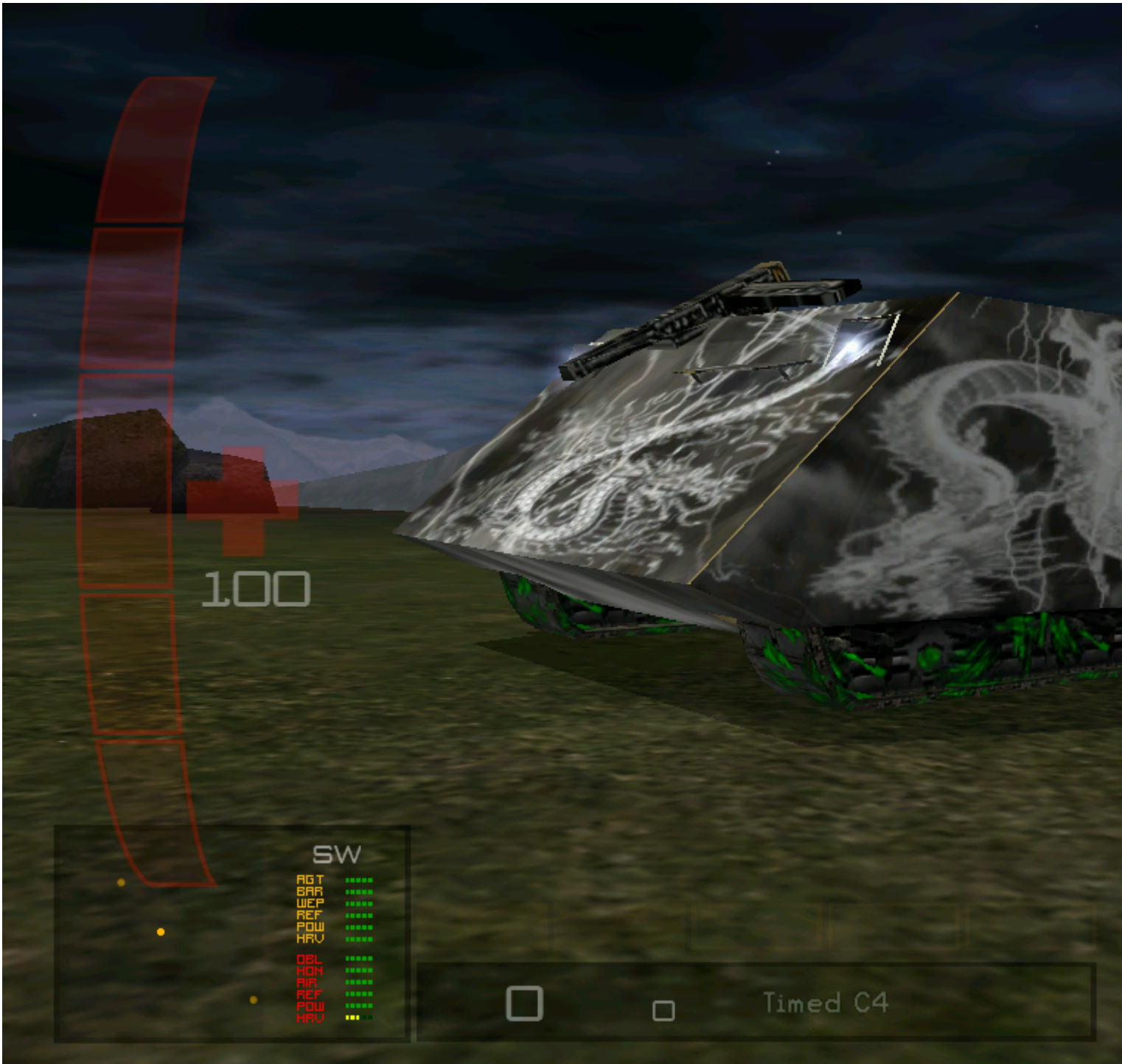
5) Game 2009-05-30 20-49-07-26.png , downloaded 1033 times