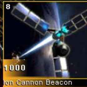
Ion Cannon Beacon