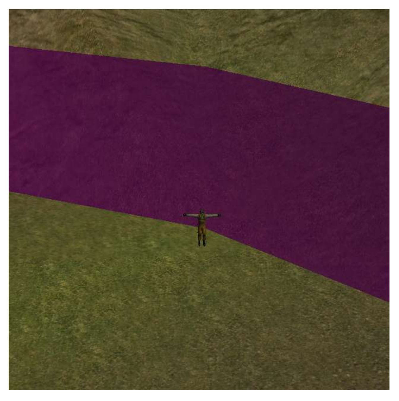
2) rf_volcano_buddyjump2.jpg, downloaded 396 times

Page 5 of 7 ---- Generated from Command and Conquer: Renegade Official Forums