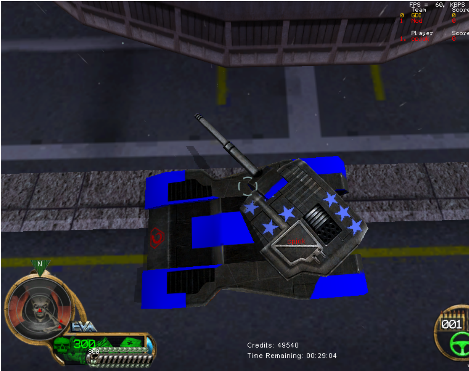
2) ScreenShot40.png , downloaded 314 times