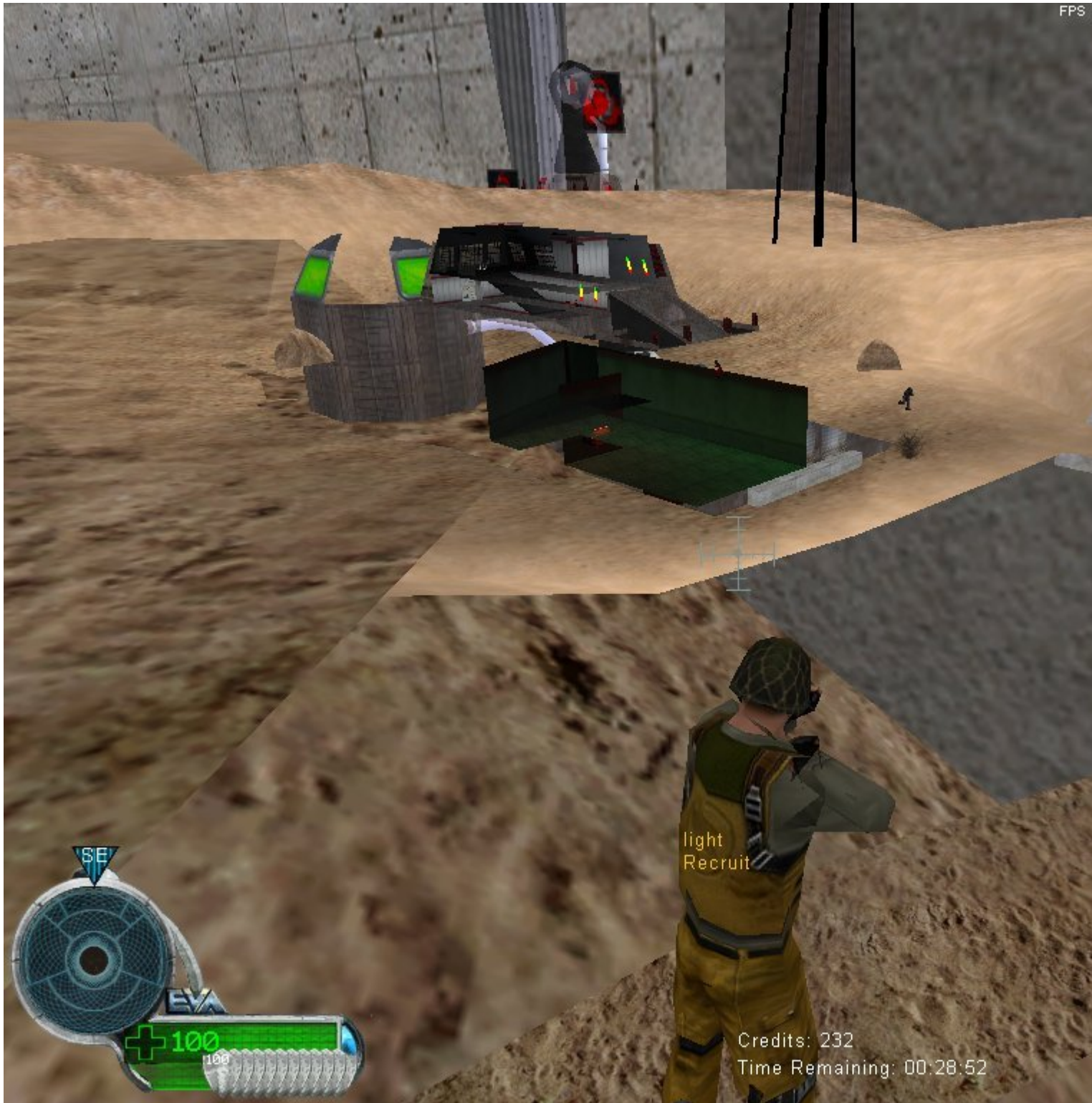
5) ScreenShot134.jpg , downloaded 717 times