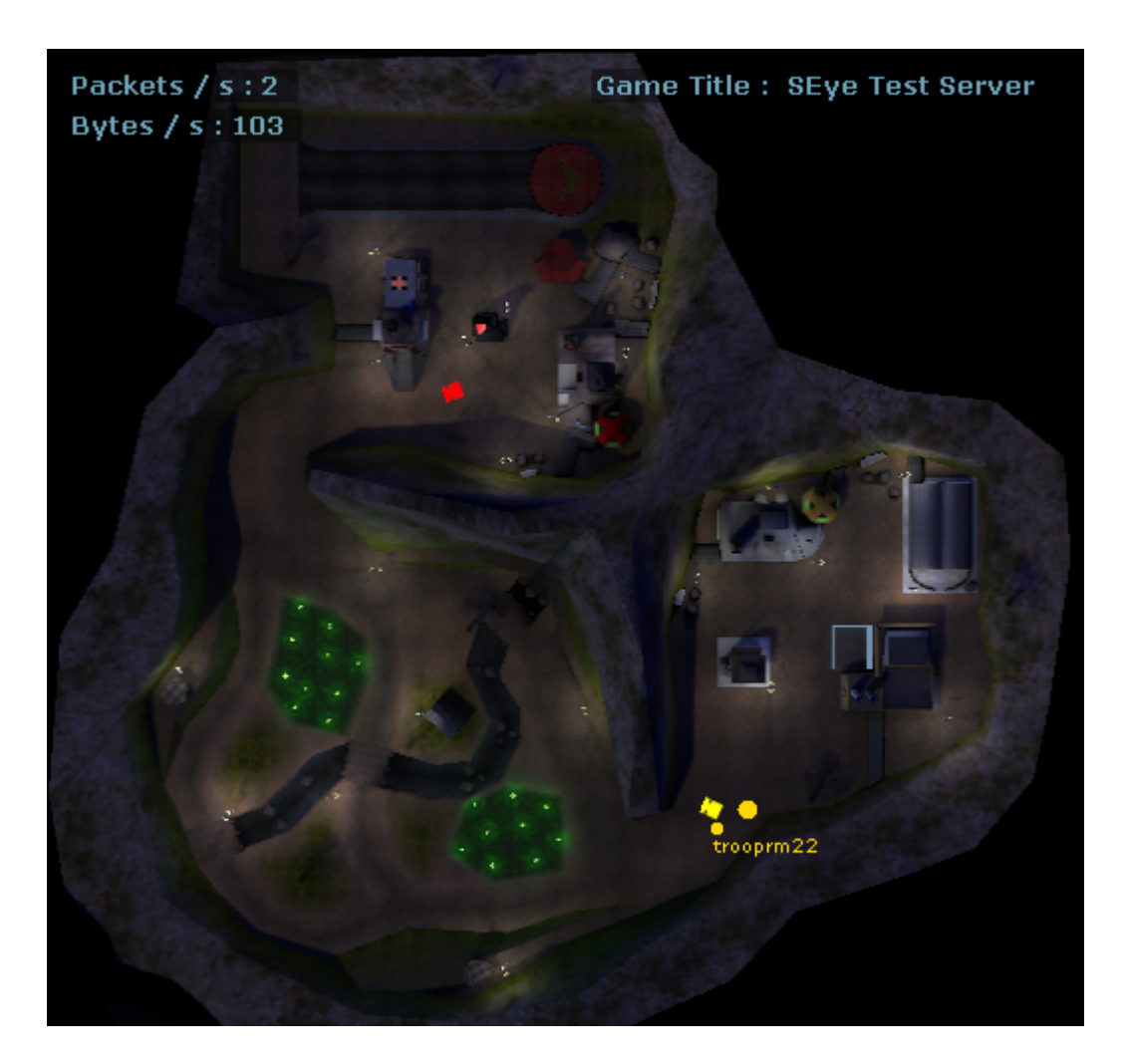
2) Thum-5-16-47.png, downloaded 931 times