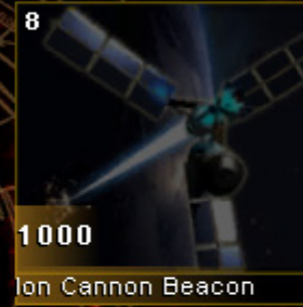
1000 Ion Cannon Beacon