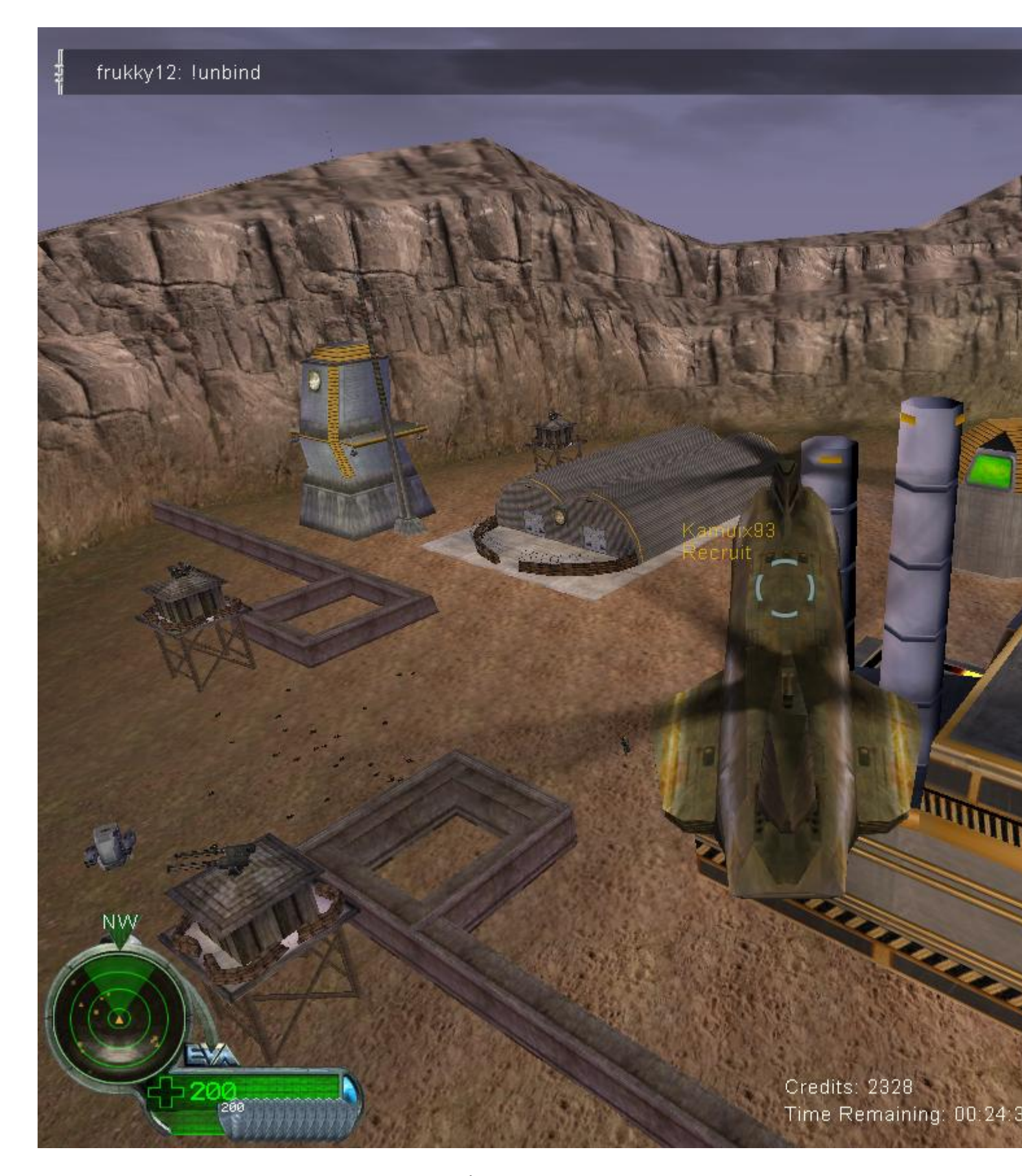
2) NOD1.JPG, downloaded 218 times