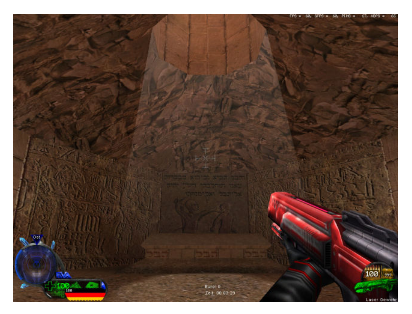
3) M13.jpg, downloaded 188 times