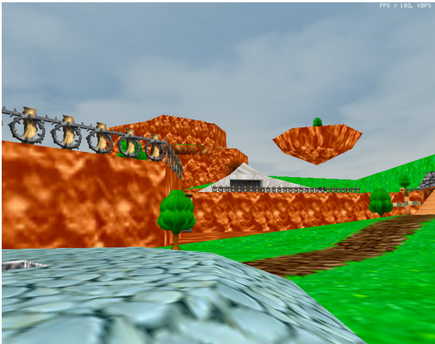
5) ScreenShot09.jpg , downloaded 1448 times